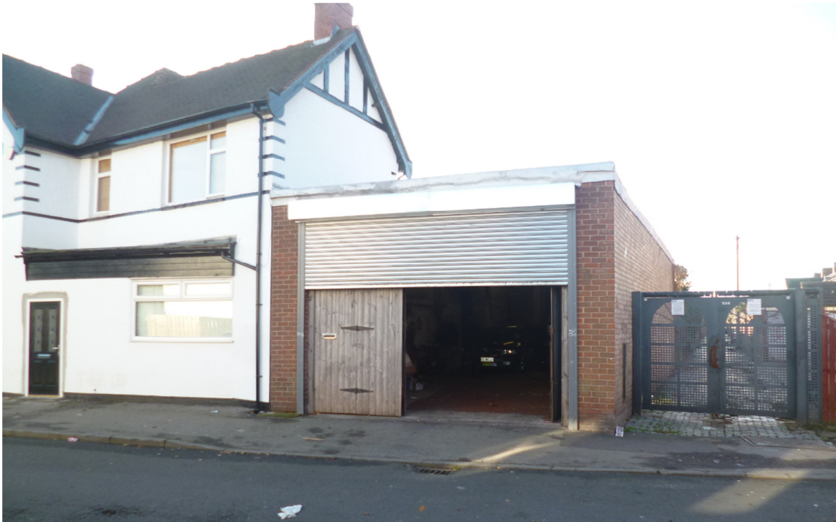
View to front