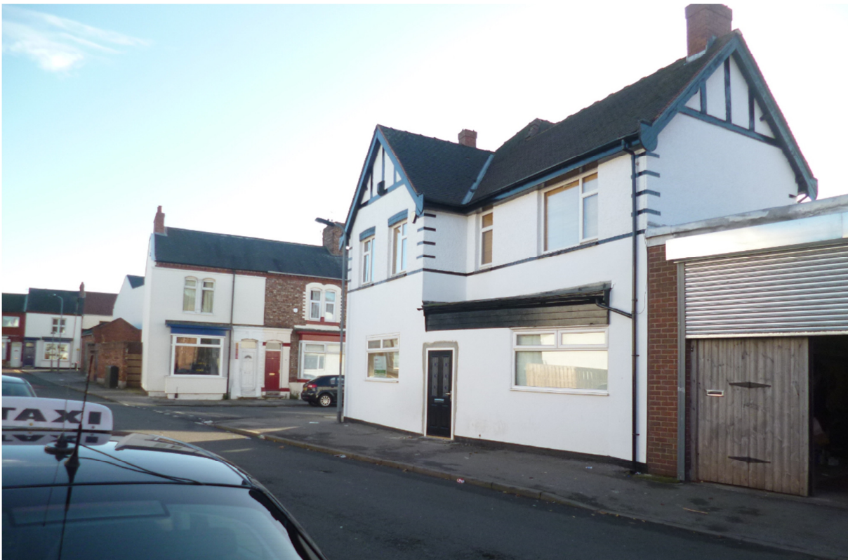
View to adjacent property (No 84)